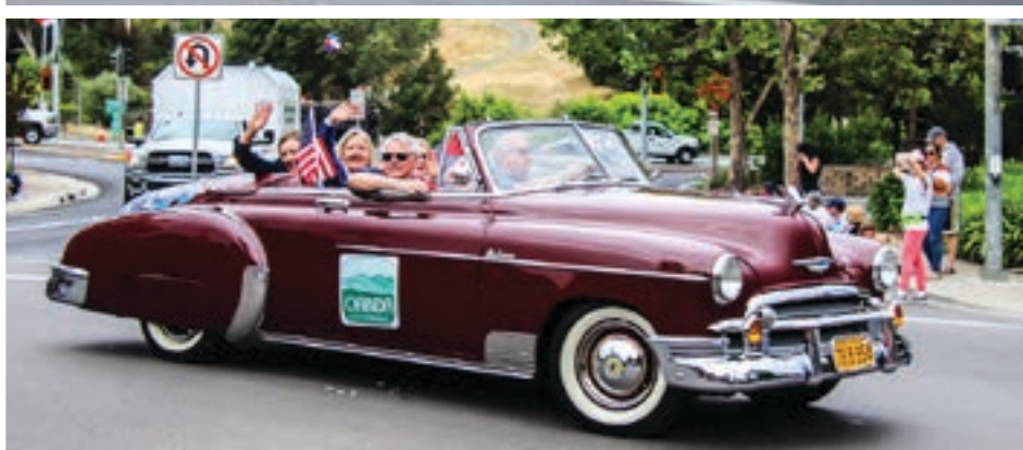
Last year's Fourth of July parade in Orinda featured marching bands, horse-drawn wagons, stilt walkers and much more.